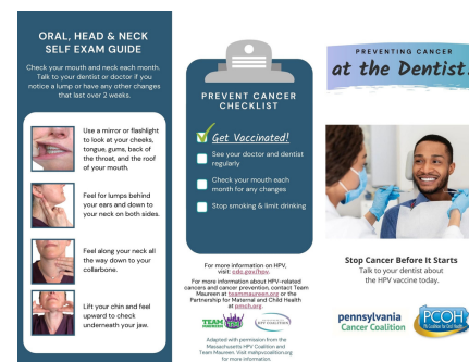
For more information on HPV, visit www.masshpvcoalition.org . For more information about HPV-related cancers and cancer prevention, contact Team Maureen at www.teammaureen.org or 800.452.2273 . #dontsmileandchuckle